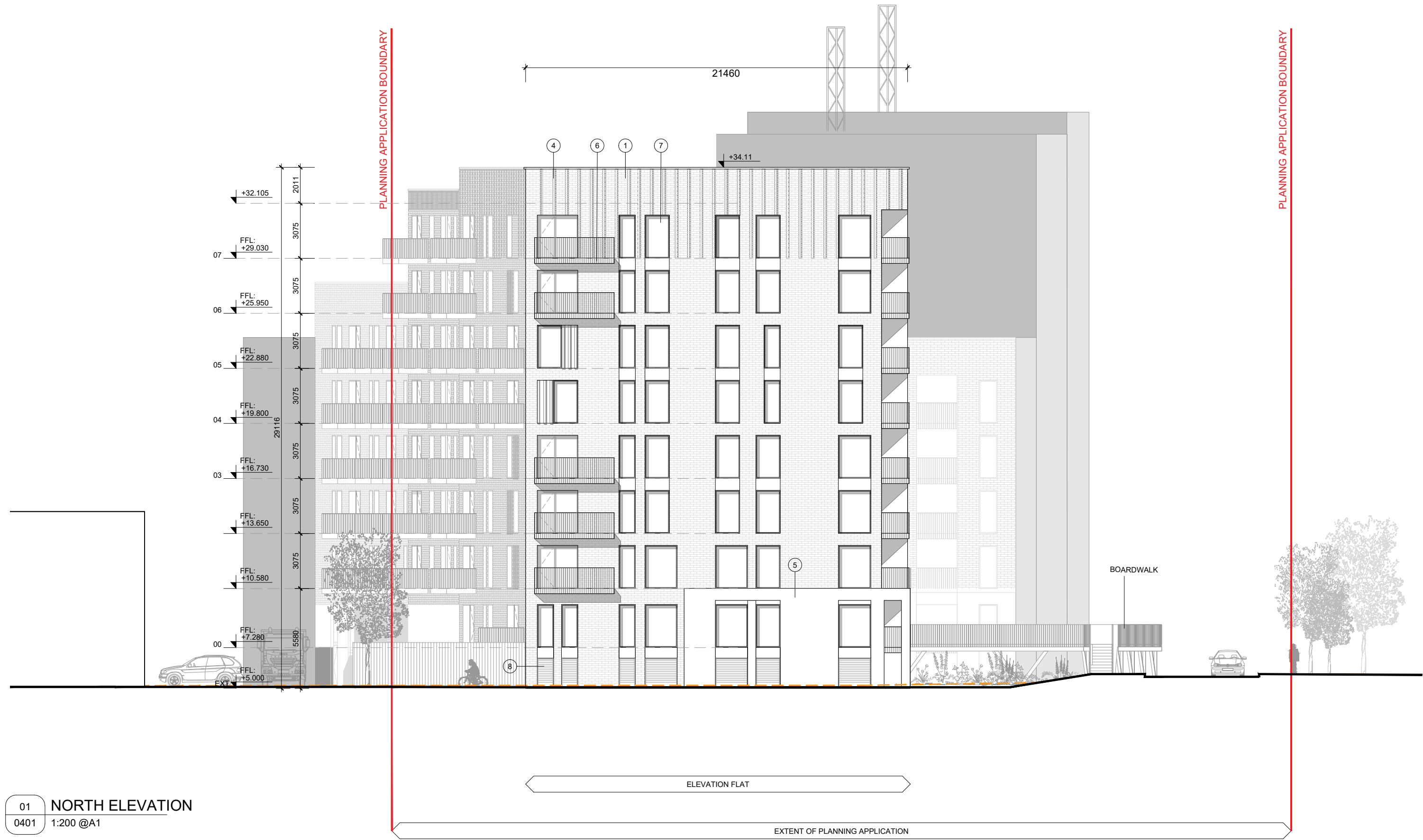
01 NORTH ELEVATION 0401 1:200 @A1