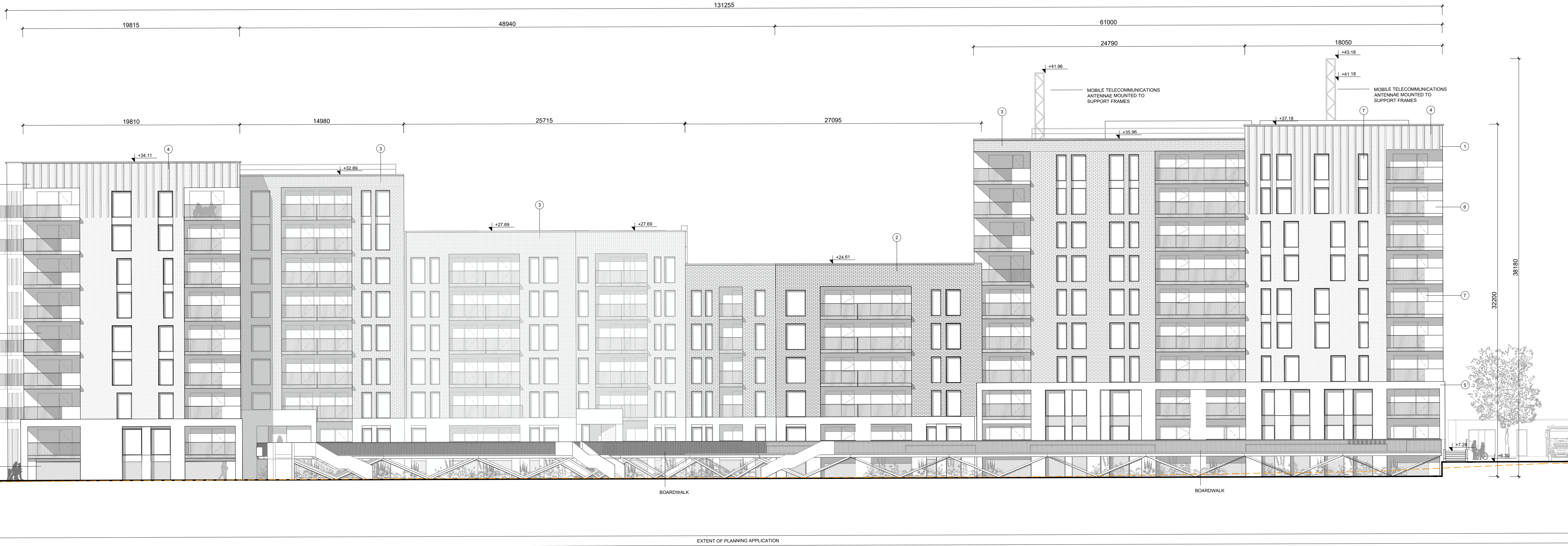
02 WEST ELEVATION 0401 1:200 @A1